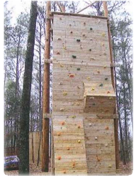
Challenge Course Tower