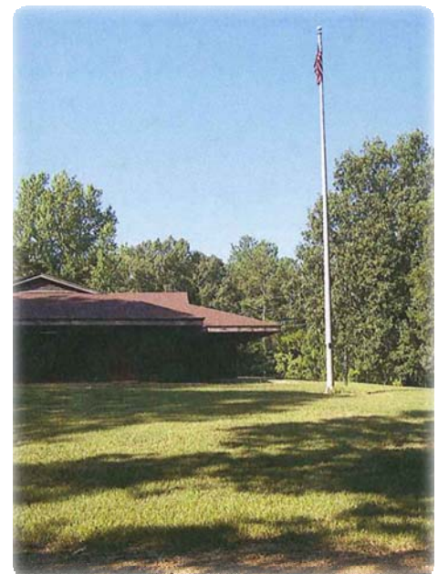
Becky Cook Hall