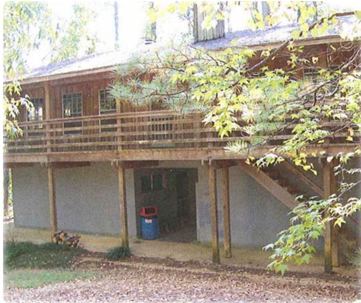
Elizabeth Gwin Troop House