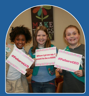
Have a strong sense of self (80% vs. 68%)

Girl Scouts are more likely than non-Girl Scouts to meet Leadership Outcomes: