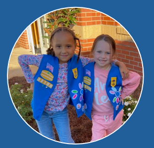
Develop and maintain healthy relationships (60% vs. 43%)