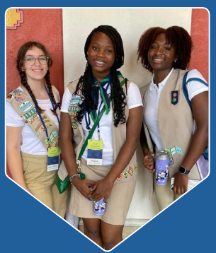
Have positive values (75% vs. 59%)