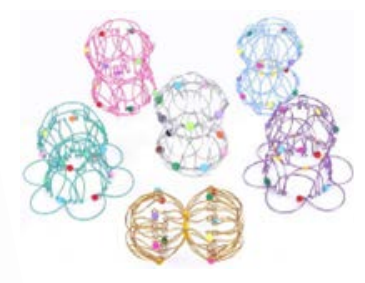
Magic Wire Hoop (assorted colors) $225 Combined Sales