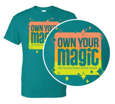
Own Your Magic T-Shirt $425 Combined Sales