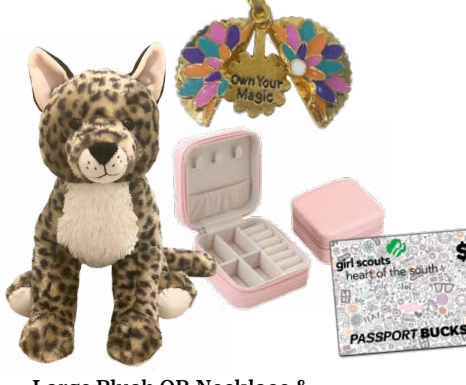
Large Plush OR Necklace & Jewelry Box (assorted colors) OR $10 Passport Bucks $750 Combined Sales