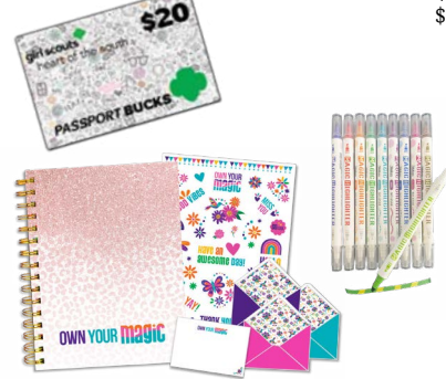
Creativity Kit OR $20 Passport Bucks $1,000 Combined Sales