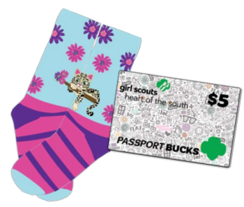
Ocelot Socks OR $5 Passport Bucks $650 Combined Sales