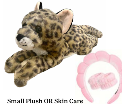
Small Plush OR Skin Care Head/Wrist Band Set (assorted colors) $325 Combined Sales