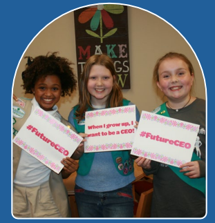
Have a strong sense of self (80% vs. 68%)

Girl Scouts are more likely than non-Girl Scouts to meet Leadership Outcomes: