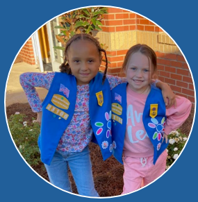
Develop and maintain healthy relationships (60% vs. 43%)